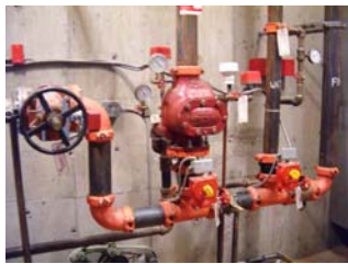
FIRE SPRINKLER VALVES