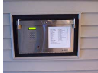
ENTERPHONE CONTROL PANEL