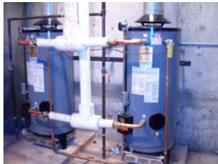
HOT WATER HEATERS

The mechanical system is analogous to the vital organs of the human body (such as the heart, liver and lungs). It comprises, amongst other things, pumps and filters for the efficient passage of fluids and air through the building. The mechanical system provides water, heating, cooling and ventilation to meet the interior conditioning and service requirements for the building occupants. The photographs below illustrate some of the typical elements of the mechanical system.