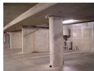
CONCRETE COLUMNS IN PARKADE

The photographs below show some of the elements of the structural system in typical condominium buildings.