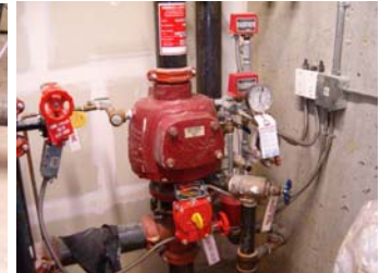
DRY SPRINKLER VALVES