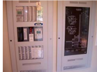
FIRE CONTROL PANEL