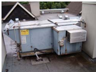
AIR MAKE-UP UNIT