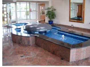
INTERIOR WATER FEATURES

Unlike many of the other building systems, interior finishes are almost always readily accessible and can therefore be maintained and renewed relatively easily. As elements of this system primarily affect aesthetic appearances, they have little impact on the performance of other systems within the building.